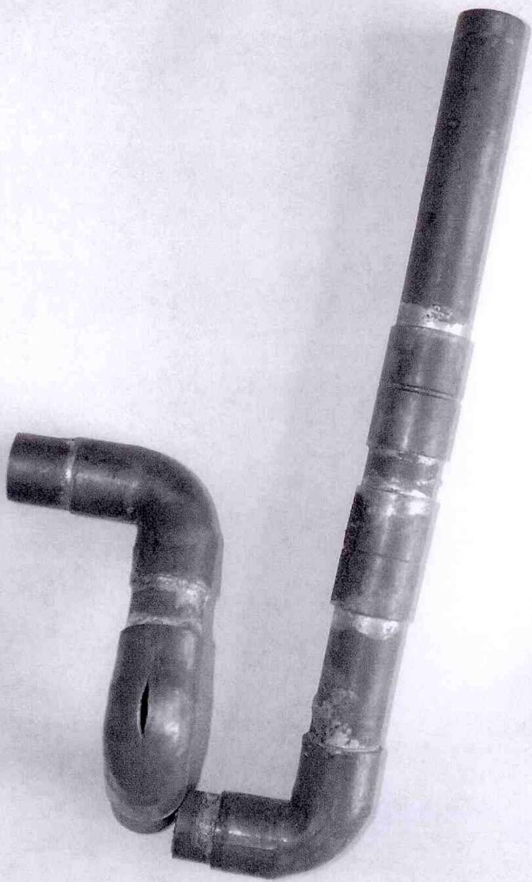
Exhibit 2 – Two Photos of Burst Pipe